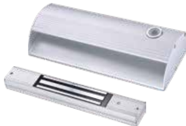
PH-500 (Exit button included)