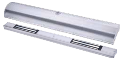
PH-750 (Exit button included)