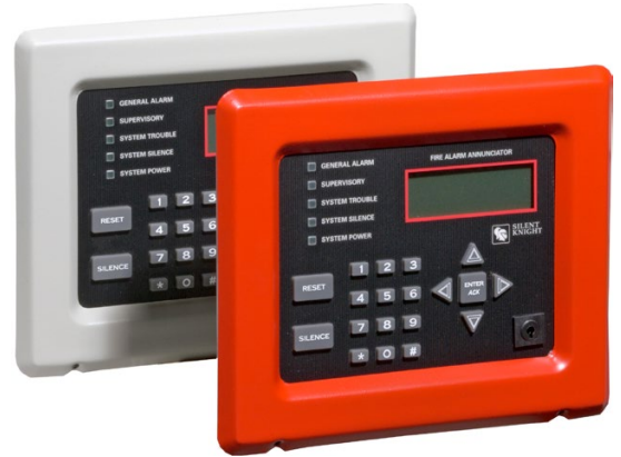
RA-1000R / RA-1000