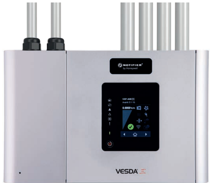
Intelligent VESDA-E VEU-A10-NTF-VN