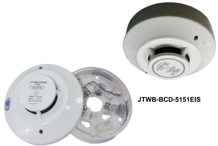
JTY-GD-2151EIS & B401