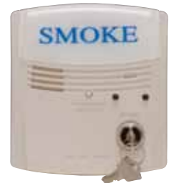
RTS2-AOS UL S2522