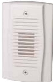
MHW UL S4011