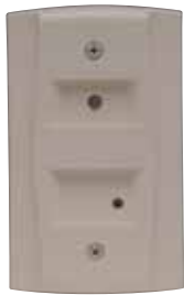
RTS151 UL S4011

System Sensor provides system flexibility with a variety of accessories, including two remote test stations and several different means of visible and audible system annunciation. As with our duct smoke detectors, all duct smoke detector accessories are UL listed.