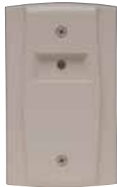
RA100Z UL S2522