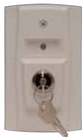
RTS151KEY UL S2522