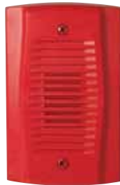
MHR UL S4011